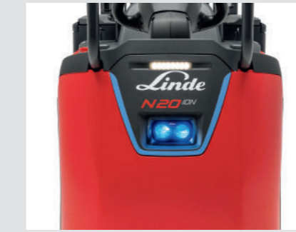
Linde BlueSpot™ and front LED light