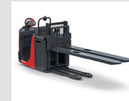
Intuitive Linde Steering Wheel